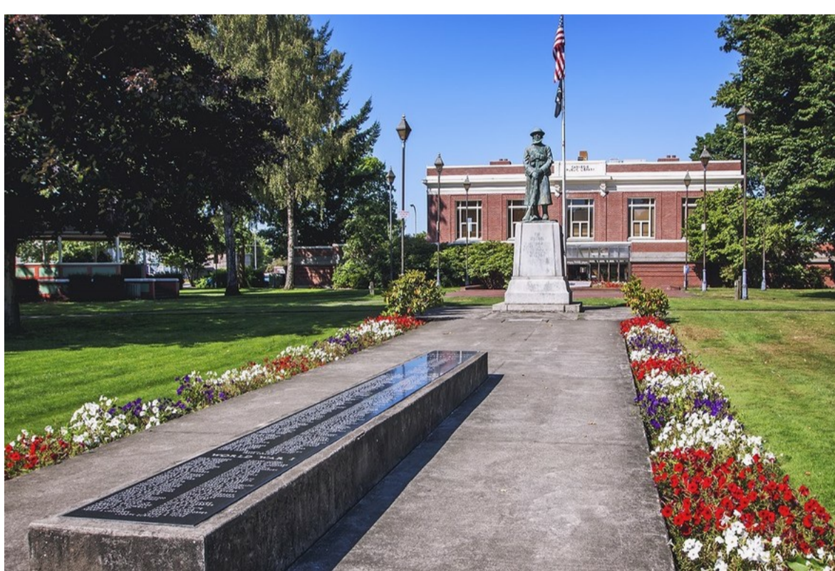
This past August, Centralia kicked off the celebration of the 200th birthday of its founder - George Washington